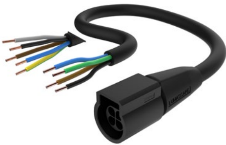
Leader Cable Line Voltage 1.5mm 2 For Connection Type 73 or 77 in CE installations

Compatible with Type 73 or 77 connectorized supply cable options. Supplied fitted with an IP68 connector for pairing with the first connectorized luminaire in a line voltage circuit. Comes complete with a matching end of circuit, line voltage terminator plug. The cable is H07RN-F compliant.